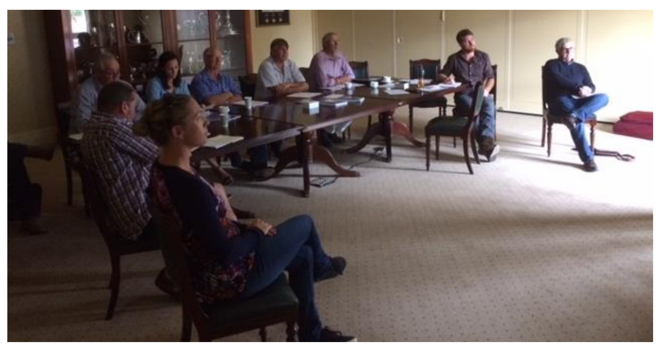
Council Roadshow in South Australia.