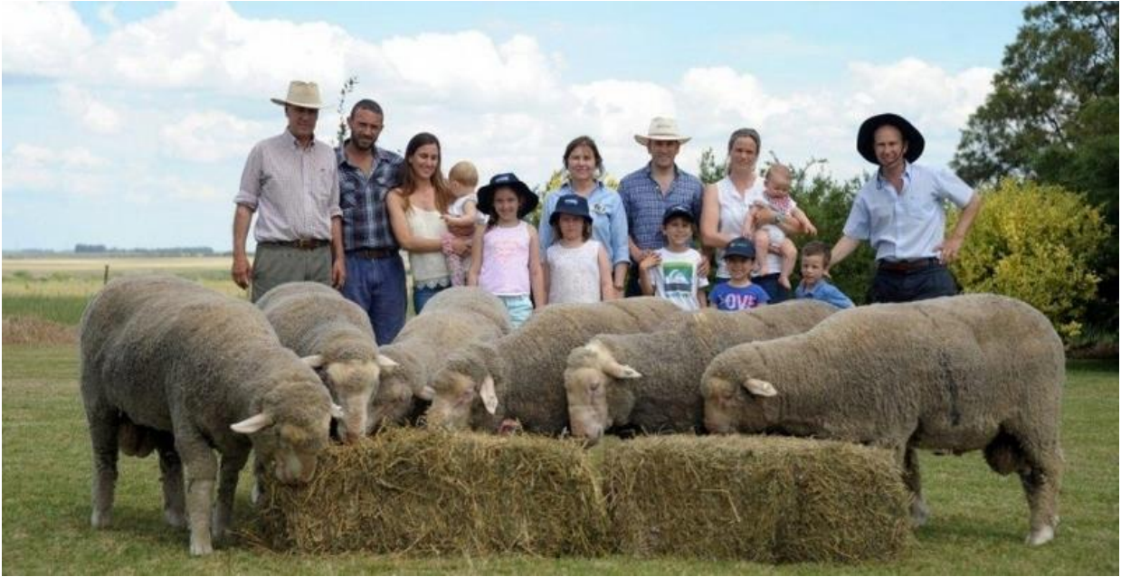
Capurro family - La Pastoral Field Day

To read full article on this event in Spanish - Click Here