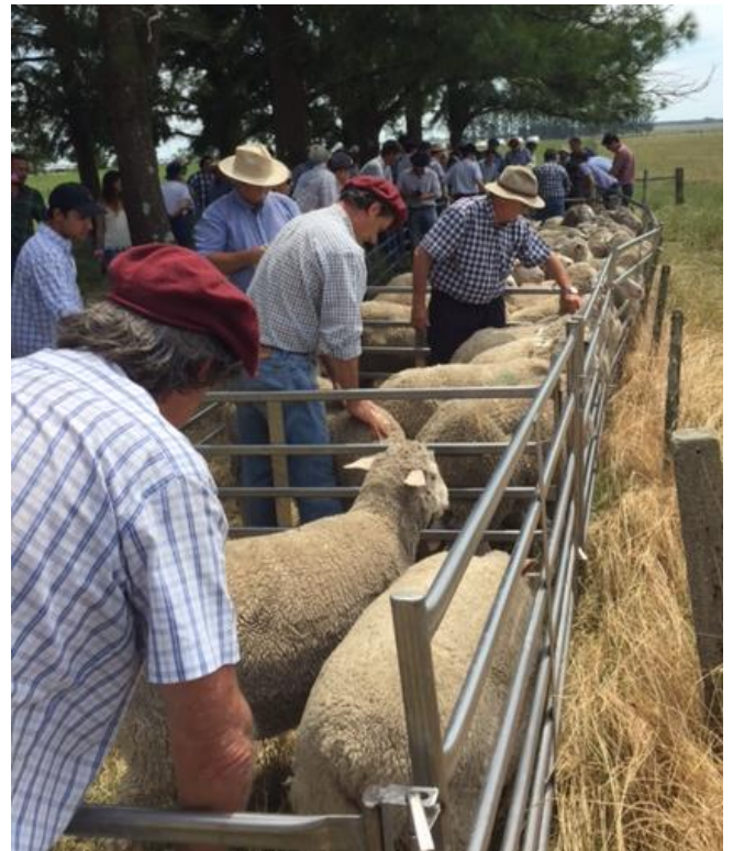
La Pastoral Field Day