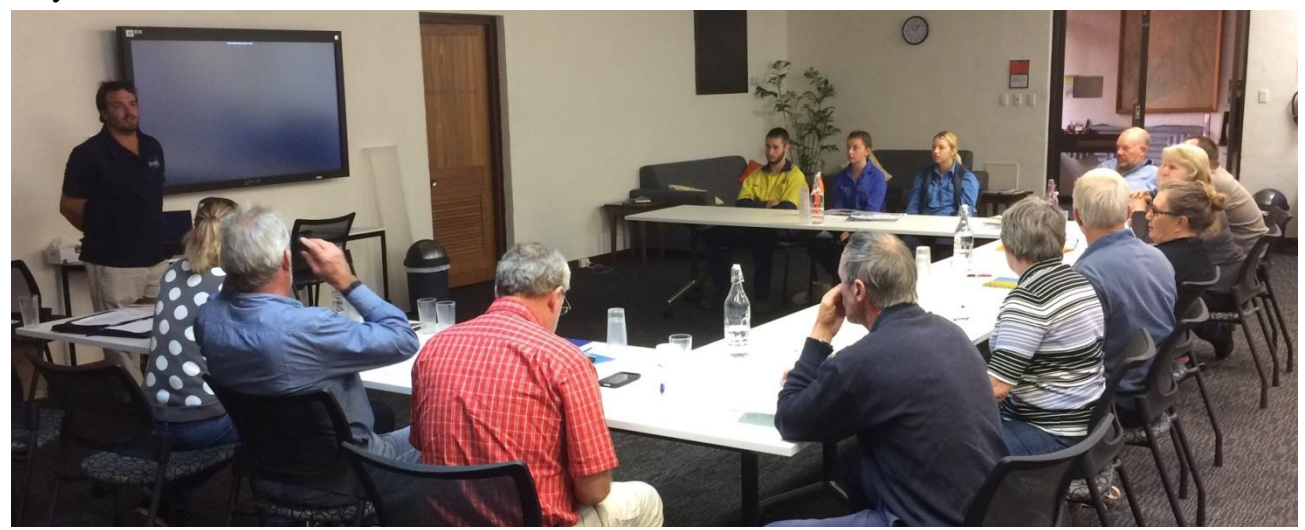
Council WA Roadshow March 2017. Muresk institute. Northam WA.