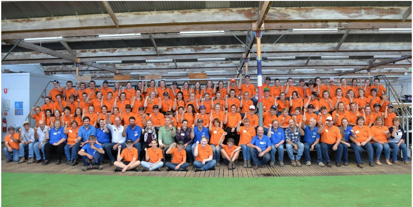
SA Sheep Expo 2018 registered participants.

This was a superbly well run event for more than 90 young people 12 yrs to about 24 yrs old. They had a 3 day event at the Royal Adelaide Showgrounds, where they learned many skills and principles of sheep breeding and care.