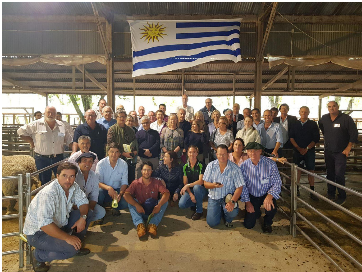
Delegates at the International Dohne Merino Conference sheep auction at Durazno Rural Society.