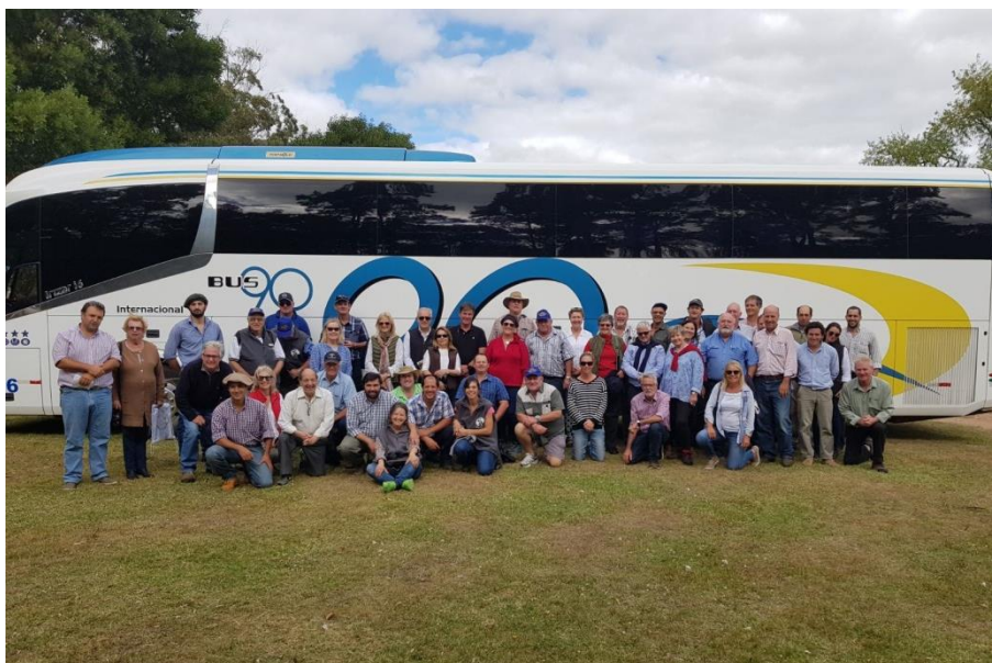
Australian, New Zealand, South African, Argentina, Chile and Uruguay delegates at the International Dohne Merino Pre-Tour and Conference in Uruguay.

The hospitality of the Uruguayans was second to none. Next edition we will report on Argentina and Chile Post-Conference Tour. Safe travelling to all delegates still making their way home.