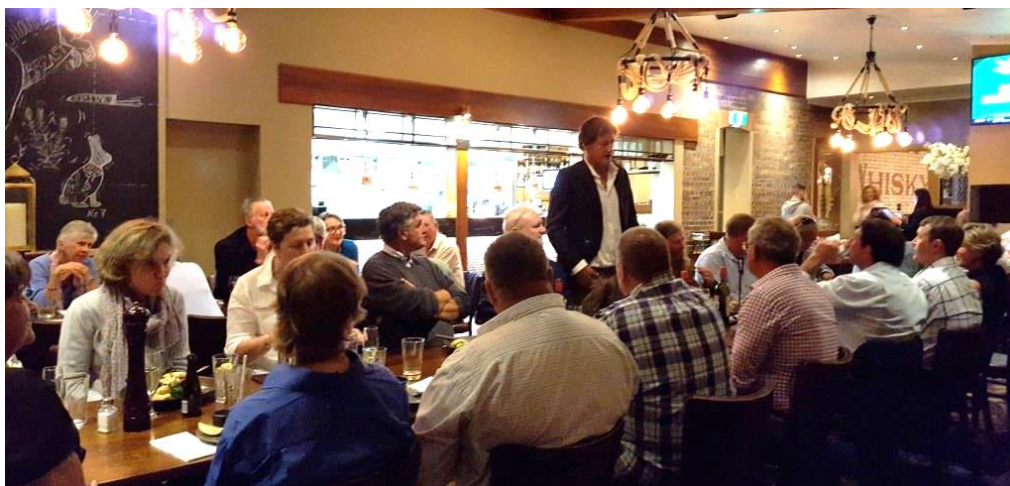
Dinner at the Whitebull Hotel with Dohne Studs.

EMD and Fat Data Ram Sale Results Australian Sheep and Wool Show Preparing for the year ahead