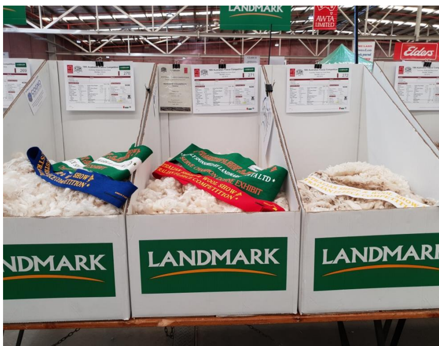
Winning Dohne Fleeces Caroonboon.