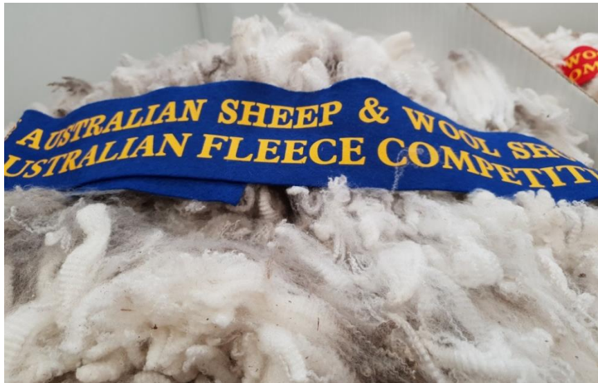
Winning Dohne fleece Stirling.