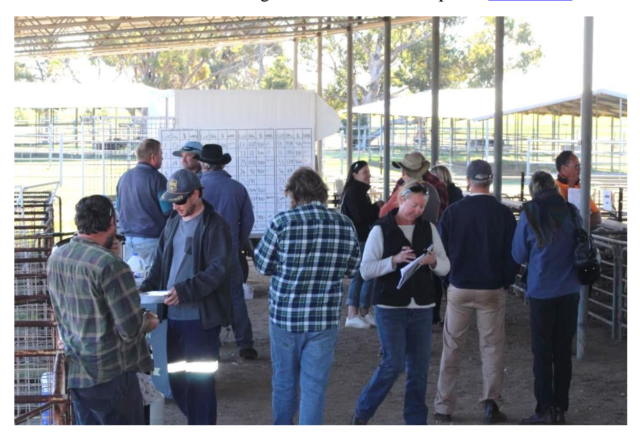
Harold Park North Ram Sale 2019.

26 rams sold to $1600 and averaged $1021. Full Sale report – Click Here