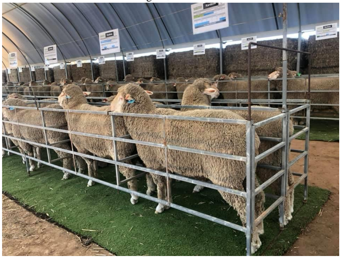
Kardinia Sale Rams.

48 rams sold to $4800 and averaged $2038.