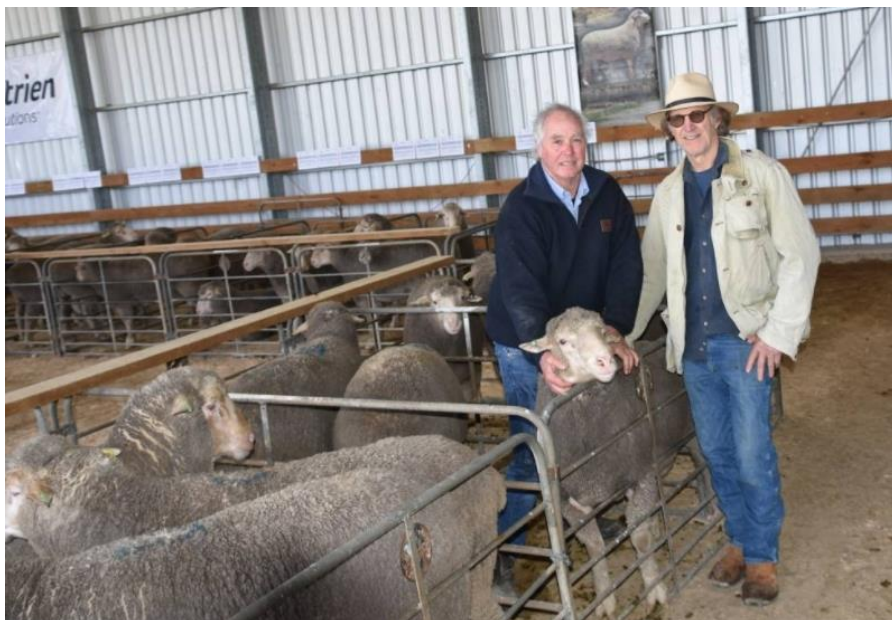
$2189 top average for South Australia – Mt Alma Dohne Stud.