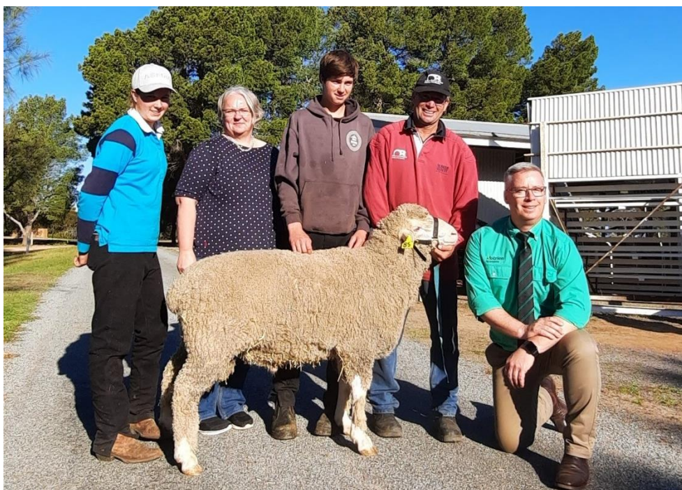
$6200 top price for South Australia – O'Brien Dohne Stud.