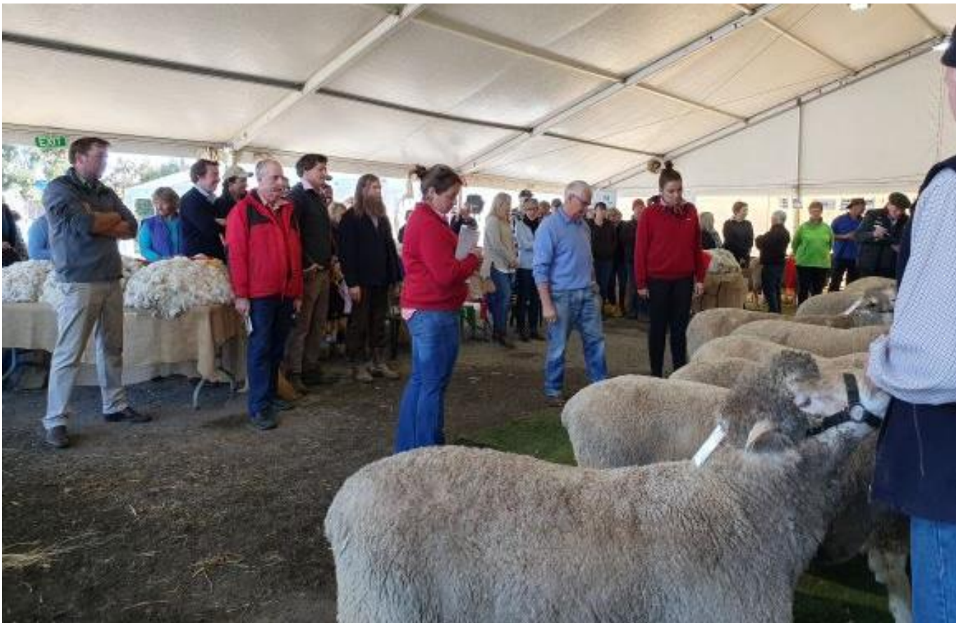
ASWS 2019 - Dohne Marquee

Regarding Victorian-based events, the Association will update members should COVID-19 management policies prohibit the events from being held.