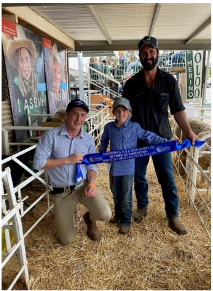
First Place Pair Ewe Hoggets, Clover Downs Dohne Stud at Jamestown Show 2022.