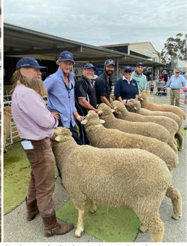
Single rams final judging selection, first place Macquarie Dohne Stud at Jamestown Show 2022.