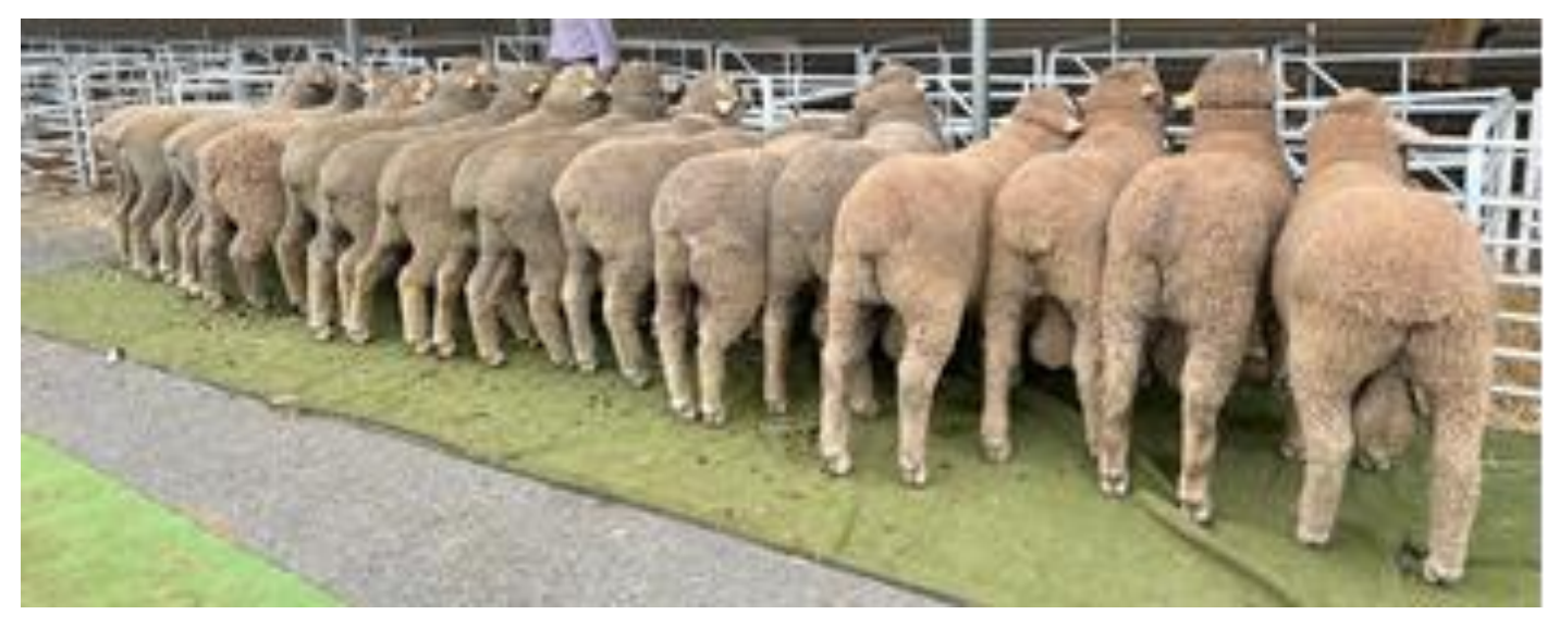
2021 Drop Dohne Show Rams at Jamestown Show 2022.