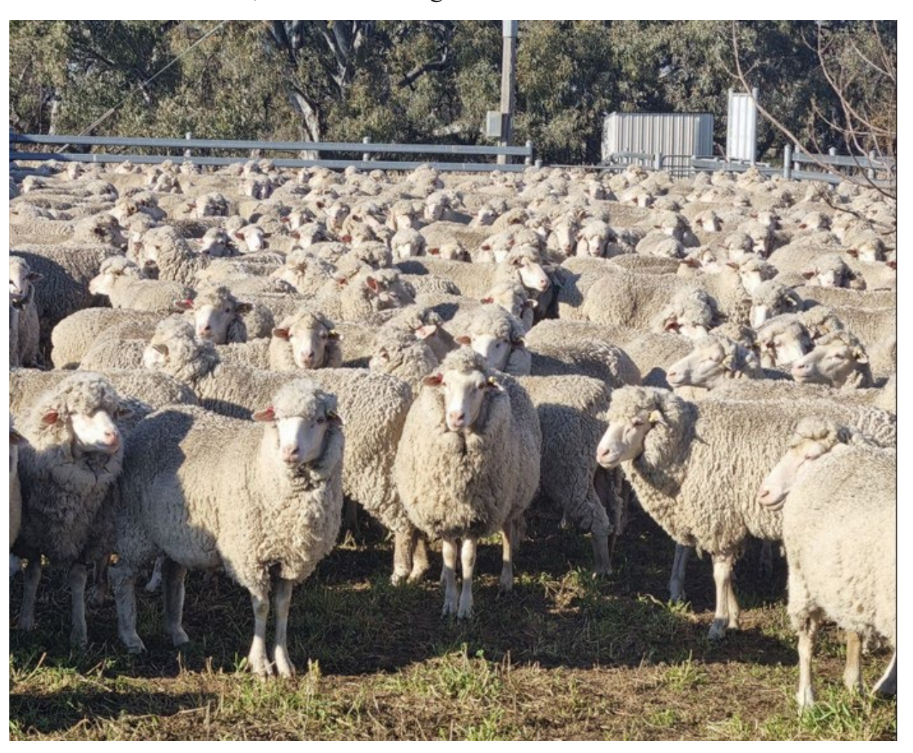
Sire Evaluation 2021 drop ewes.

Don Mills – Convenor, ADBA Coonong Sire Evaluation