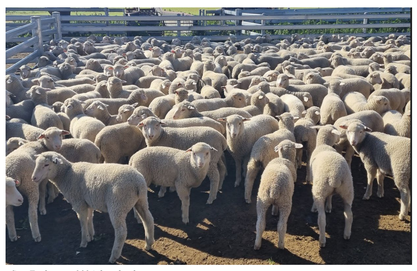
Sire Evaluation 2024 drop lambs.