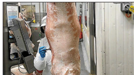
The family sent a line of Dohne lambs to Gundagai Meat Processors, with 71 per cent achieving the GLQ5+ bonus.

environment and the lambs do very well when finished on barley in a feedlot."